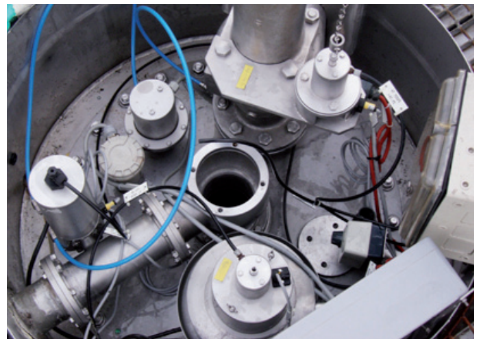
TANKO® S50 installation position tank dome