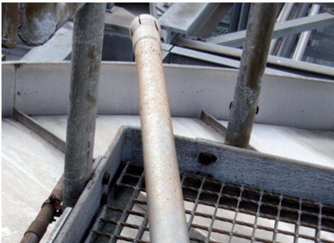
TANKO® S50 at the cleaning lance

The customer is highly convinced of the economic efficiency of the TANKO® S50 and has recommended the TANKO® S50 to further breweries of this international brewery group.